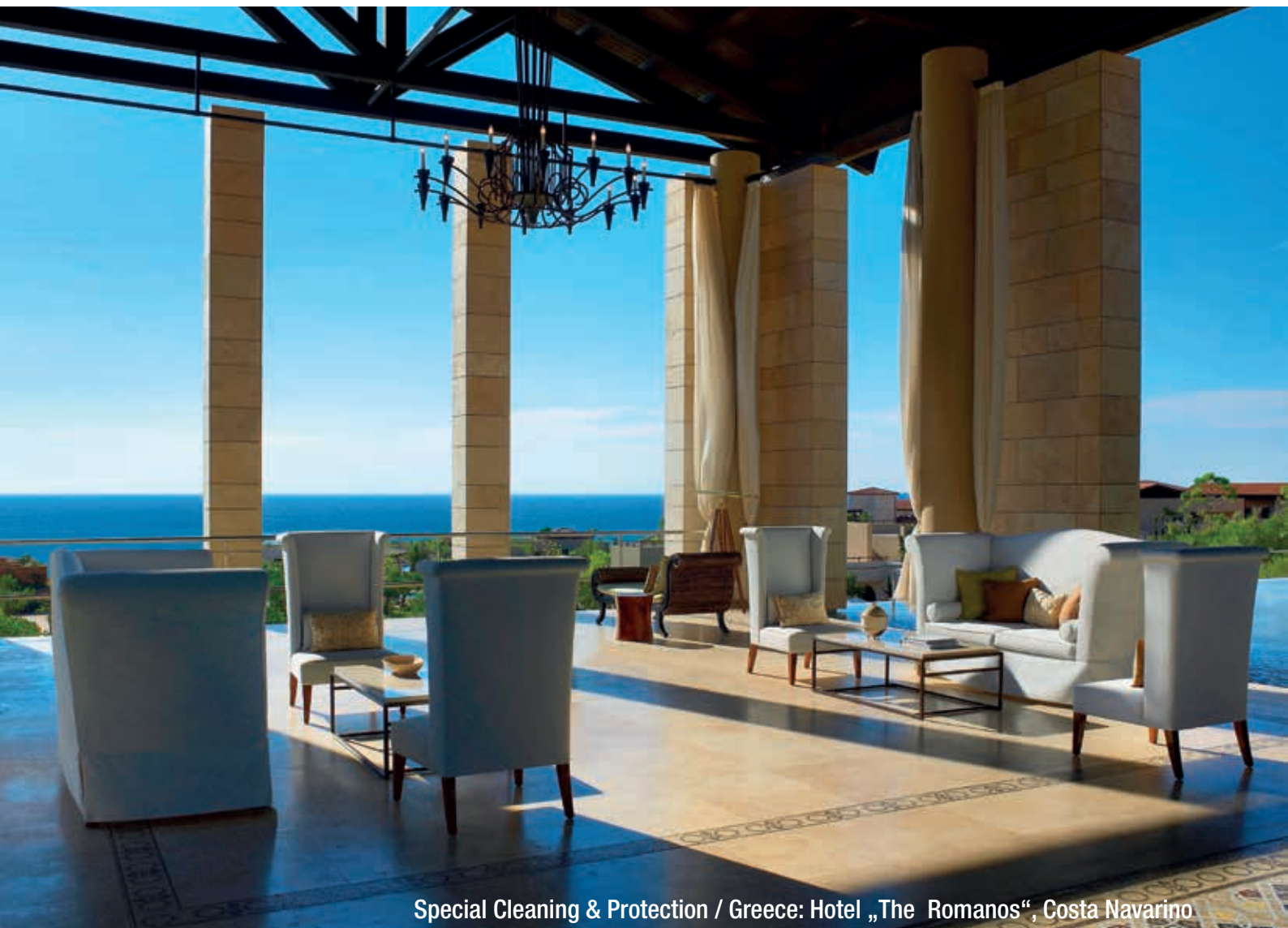
Special Cleaning & Protection / Greece: Hotel „The Romanos“, Costa Navarino