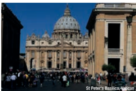
St Peter's Basilica, Vatican