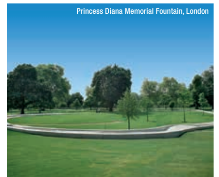
Princess Diana Memorial Fountain, London