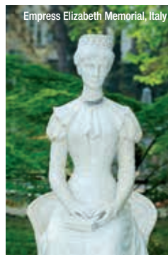
Empress Elizabeth Memorial, Italy