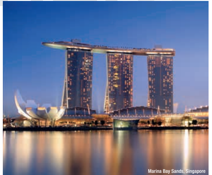
Marina Bay Sands, Singapore