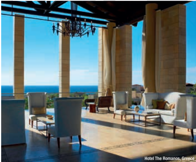
Hotel The Romanos, Greece