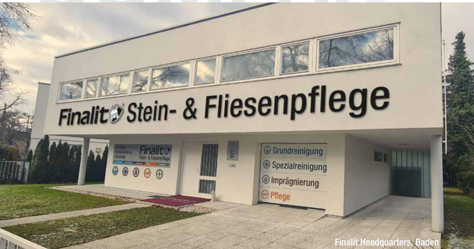
Finalit Headquarters, Baden