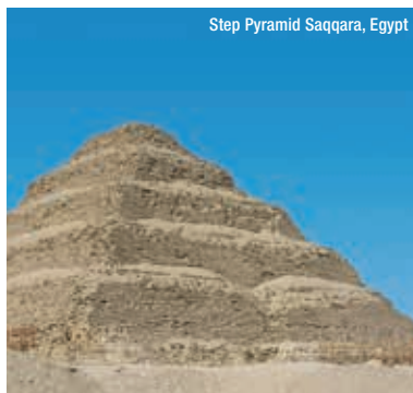
Step Pyramid Saqqara, Egypt