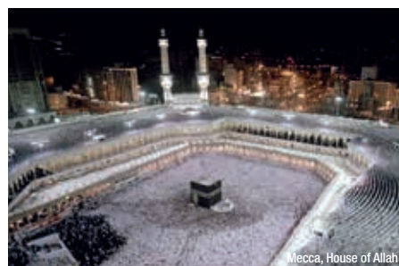
Mecca, House of Allah