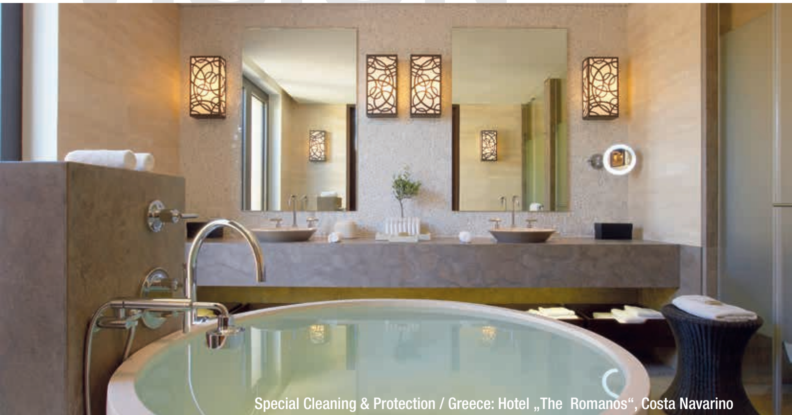
Special Cleaning & Protection / Greece: Hotel „The Romanos“, Costa Navarino