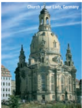
Church of our Lady, Germany