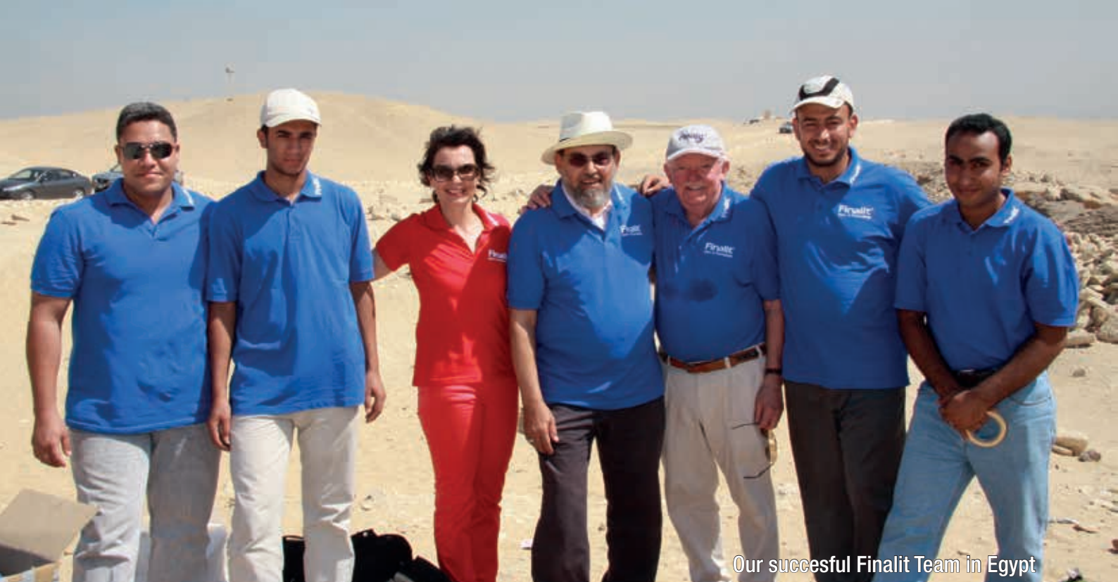
Our successful Finalit Team in Egypt